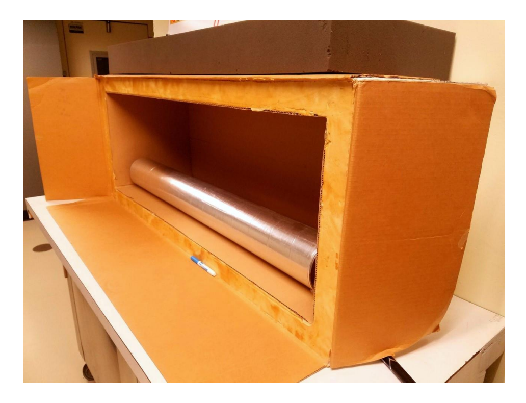
Cardboard box with Styrofoam and ice core tube to represent the general structure of an ice core container for transport and storage.