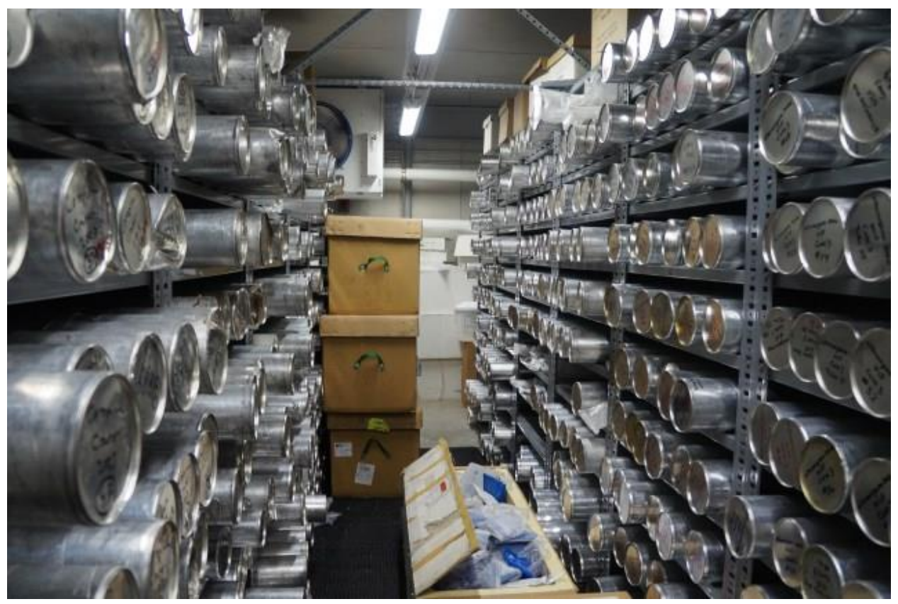
Ice core freezer.