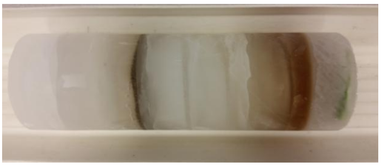
Ice core created for classroom instruction.