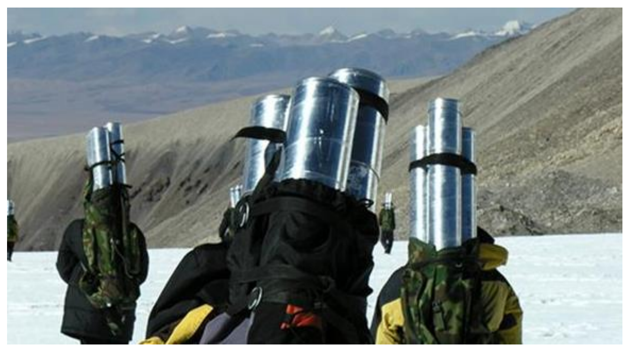
Ice cores carried from a glacier.