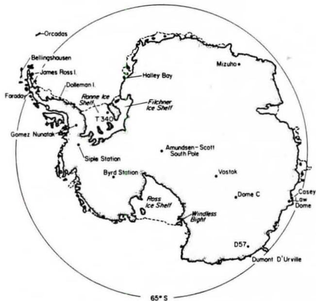
Figure 1. Core sites and meteorological stations discussed in the text.

limit the time resolution possible. To examine the last 500 years as recorded in Antarctic ice cores, annual- to decadal-time resolution is essential and the precision of the time scale is a major consideration. Data drawn from other authors are presented as faithfully as possible with respect to time, and any annual or decadal averages presented were calculated from the time series as originally published. The reader is encouraged to review the original records if more specific information is desired.